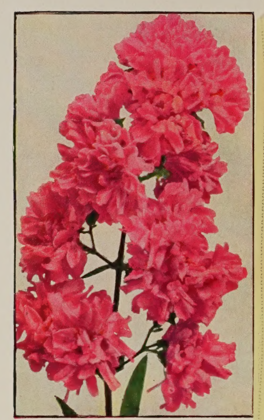
LYCHNIS Viscaria fl.-pl.